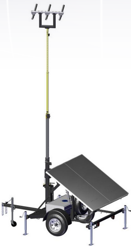
CT3 20' Mast