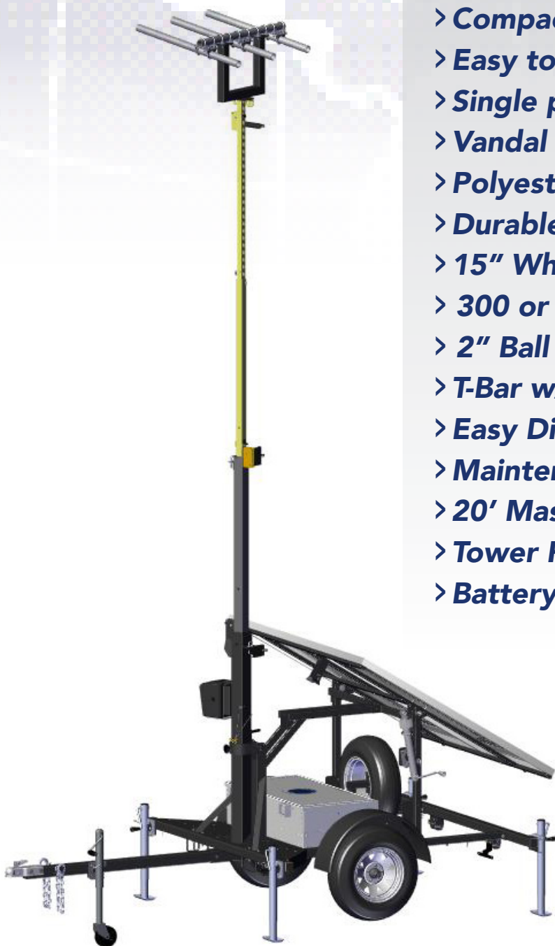
Fully Deployed Position