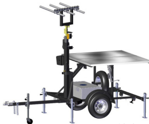
Folded / Travel Position